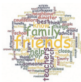
What young people do when life gets them down and tough to handle.

In this third and final edition by the Porirua Social Sector Trial (PSST) we hear more about the Blitz Youth study carried out by the University of Otago with 100 children and young people and 100 parents, youth leaders and providers.